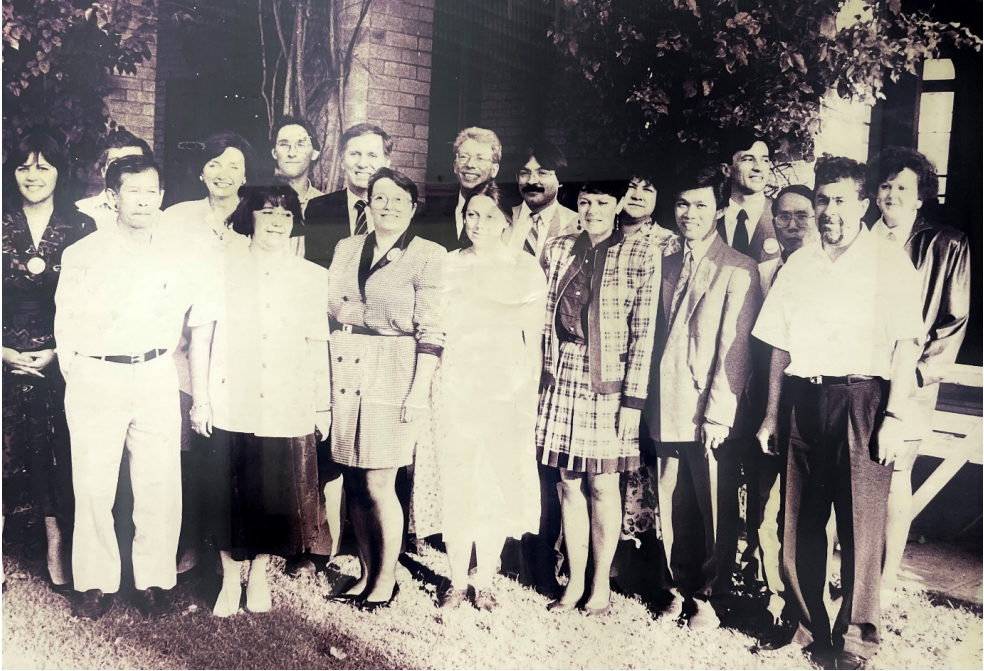
STARTTS colleagues (1990/91).

The conceptual framework proposed in this pioneering article guided STARTTS service provision philosophy through these tumultuous times and enabled the service to adapt, evolve and grow without compromising the key elements that make it effective and relevant to our clients and their communities.